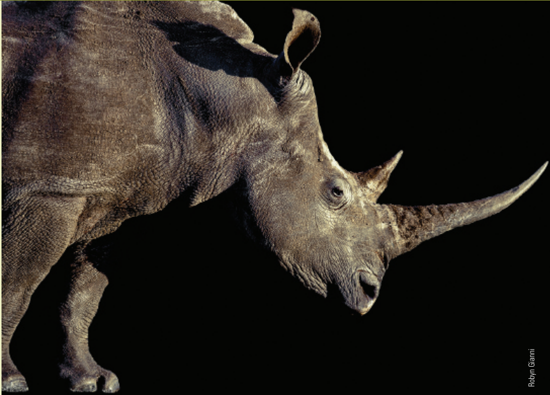
Increasing numbers of African wildlife are being poached, part of an illegal wildlife trafficking crisis plaguing the continent. According to the IUCN African Rhino Specialist Group, the rate of rhino poaching in 2012 represented a loss of almost 3 percent of the population.