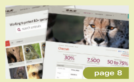
More species, cool facts, and interactive features make the redesigned AWF.org an online destination.