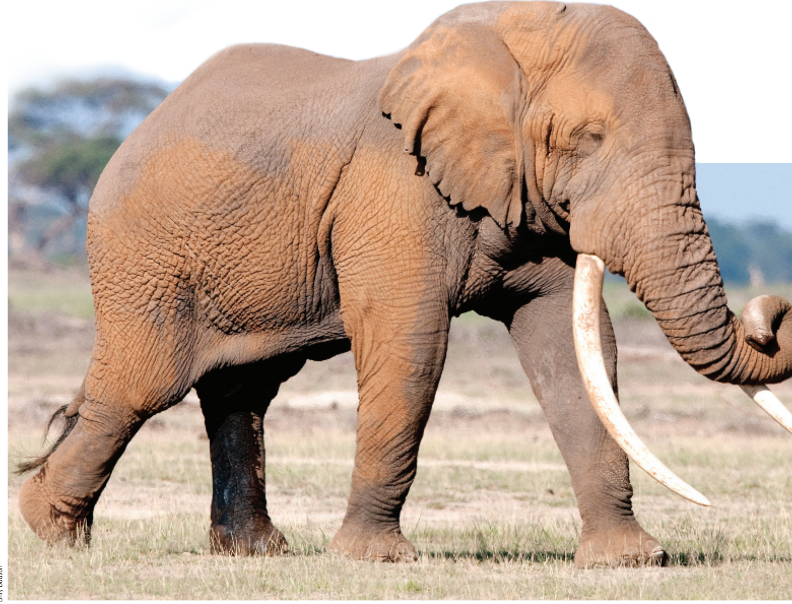
lvory from elephants continues to be in high demand on the black market. In February, Gabon announced that poachers had killed more than 11,000 of its elephants—up to 77 percent of its population—since 200 The following month, 89 elephants—including 33 pregnant females and 15 calves—were poached in less than one week in Chad.