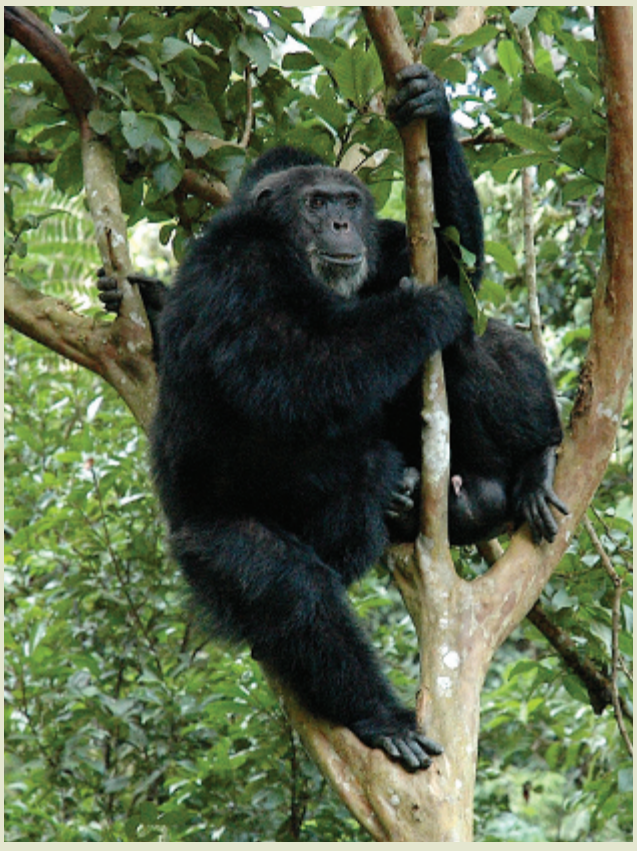
AWF is launching an African Apes Initiative to protect targeted great ape habitats, including those of chimpanzees (such as above), in West and Central Africa.

Meanwhile, a study published last year in the journal, "Diversity and Distributions," found that the total "suitable environmental conditions" for African apes—i.e., total great ape habitat—declined by 208,000 sq. km between the 1990s and 2000s. That's more than 51 million acres, roughly the equivalent of four soccer fields every day over 20 years.