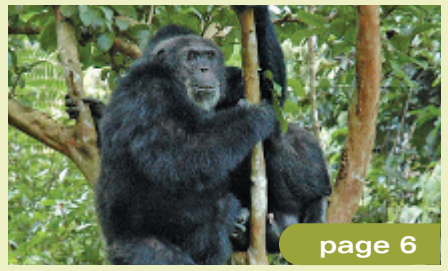
AWF launches the all-new African Apes Initiative to help great apes across the continent.