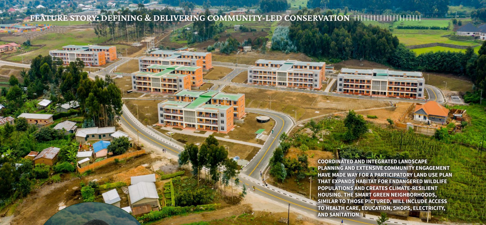
COORDINATED AND INTEGRATED LANDSCAPE PLANNING AND EXTENSIVE COMMUNITY ENGAGEMENT HAVE MADE WAY FOR A PARTICIPATORY LAND USE PLAN THAT EXPANDS HABITAT FOR ENDANGERED WILDLIFE POPULATIONS AND CREATES CLIMATE-RESILIENT HOUSING. THE SMART GREEN NEIGHBORHOODS, SIMILAR TO THOSE PICTURED, WILL INCLUDE ACCESS TO HEALTH CARE, EDUCATION, SHOPS, ELECTRICITY, AND SANITATION.