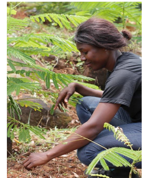
THE ENVIRONMENTAL FOUNDATION FOR AFRICA IS A LOCAL NGO WORKING IN SIERRA LEONE AND A FOUNDING ORGANIZATION OF ACBA. EFA'S COMMUNITY-LED EFFORTS HAVE SIGNIFICANTLY CONTRIBUTED TO PEACEBUILDING IN SIERRA LEONE AND NEIGHBORING LIBERIA THROUGH ENVIRONMENTAL EDUCATION AND LAND RESTORATION.