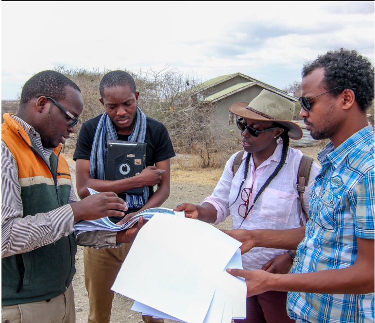
▲ CMA's learn from practical experience in the field.

develop proposals for various public sector donor agencies. Participants will also be called upon, as needed to assist in priority assignments.