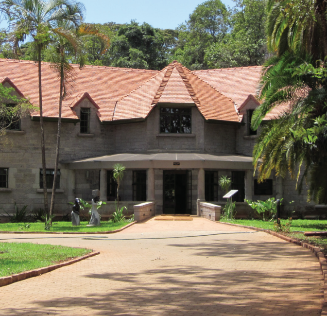
▲ AWF headquarters: Conservation Management Associates work out of AWF headquarters in Nairobi at the beginning of the program.